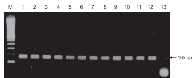
Figure 1. Agarose gel electrophoresis of PCR amplifications of gene fragment of 12S rRNA with primer L1373/H1478 of authentic turtle specimens. Lane 1-12: PCR products of 12 turtle shells, numbers: 1: Ie, 2: Sc, 3: Kt, 4: Mo, 5: Ca, 6: Ms, 7: Sq, 8: Mi, 9: Mt, 10: Cr, 11: Pm and 12: Hg, respectively; lane 13: extract control; lane M: DNA 100-bp ladder size marker.

The PCR products of cytochrome b gene of 12 turtle references were directly sequenced for evaluation due to lack of sequence data of cytochrome b gene in Genebank. After sequences of Pair-Wise alignment analysis of PCR products of 12S rRNA and cytochrome b genes, the rooted dendrogram were generated as shown in Figure 3. Sequences of 12S rRNA fragment could be properly distinguished among the 12 turtle references, with sequence difference of each pair of about 7~23%.